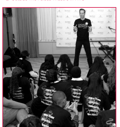
▲ Students learning how a show is developed for Broadway