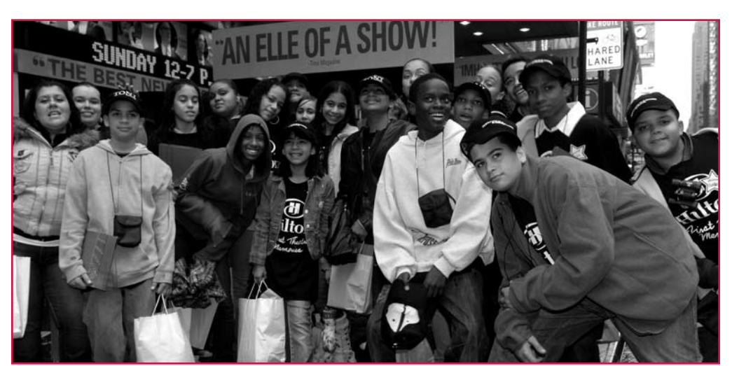
▲ Outside The Palace Theatre in NYC