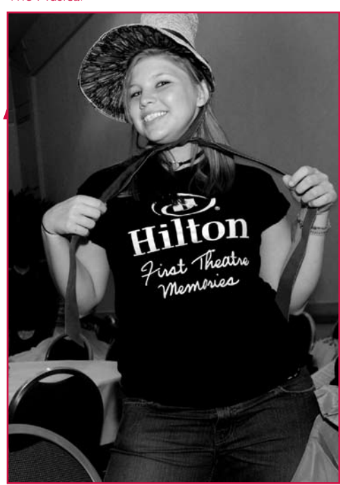
▲ Students trying on costumes in Atlanta