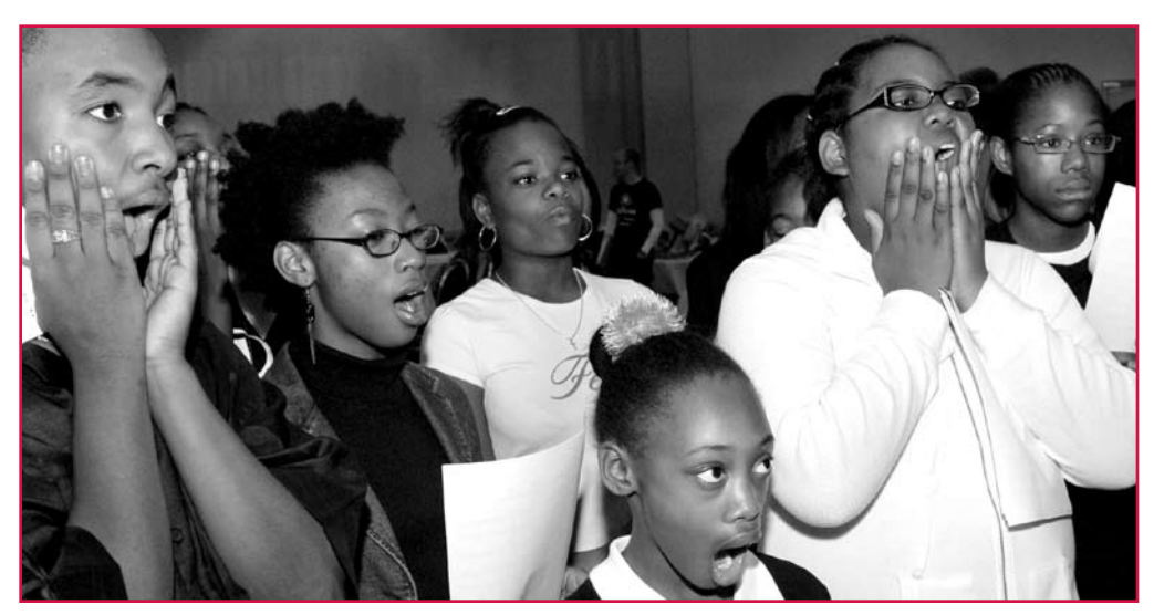
▲ Students doing vocal warmups in Atlanta