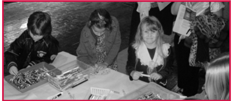
Students participate in events at the Tampa Bay Performing Arts Center