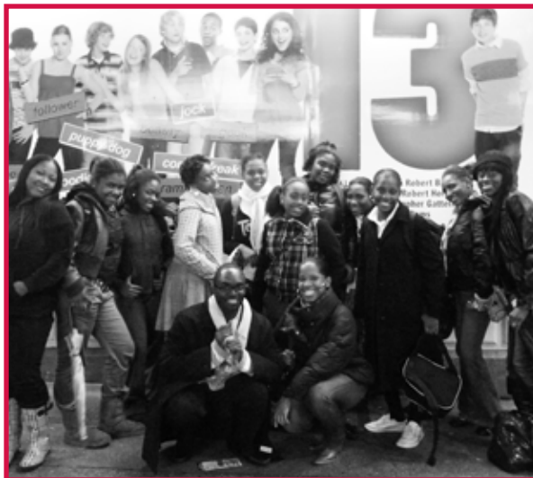
▲ Harlem Children's Zone's participating families attend a performance of the Broadway musical, 13 , in New York City