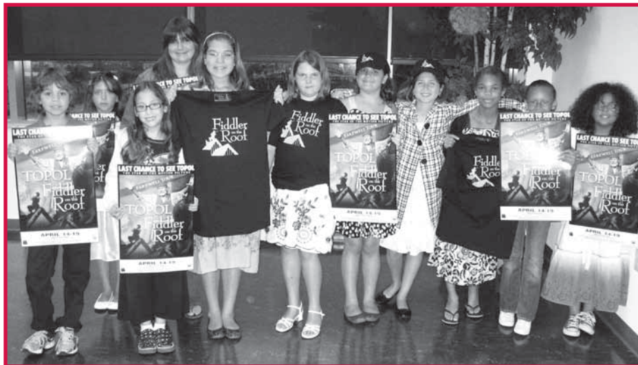
▲ Families from the Boys and Girls Clubs of Palm Beach County attend the touring production of Fiddler on the Roof hosted by the Kravis Center for the Performing Arts in Florida.

The Broadway League is thrilled to report receipt of a $50,000 grant from the Theatre Sub-District Council for the Family First Nights program in New York City for the 2009–2010 season. This funding ensures that the program will expand to all five boroughs next year, in addition to launching in ten additional cities nationally.