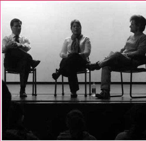
▲ Broadway stage managers speak with students at the Borough of Manhattan Community College.