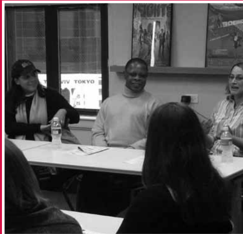
▲ High school students from the All Stars Production of Youth by Youth Program learn from Broadway producers and general managers.