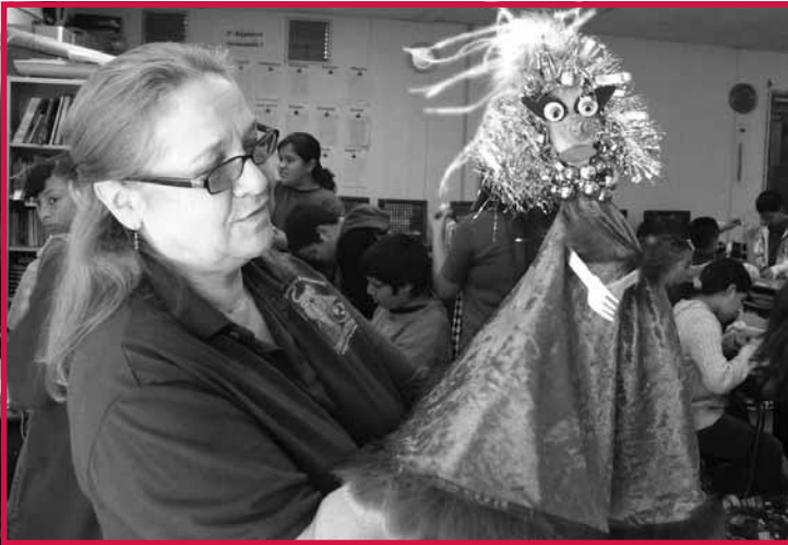
Students learning puppetry in Sacramento

California Musical Theatre's whimsically named "Lions and Puppets and Kids! Oh my!" program introduces middle-school students to puppetry as a theatrical medium. All 6th, 7th and 8th grade students at the Language Academy of Sacramento are participating in a yearlong project introducing them to history, construction, principles and techniques of puppetry in conjunction with the upcoming Sacramento engagement of Disney's The Lion King .