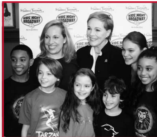
Julie Andrews and her daughter Emma Walton Hamilton with child performers from various Broadway shows.

◀ The Broadway production of The 25th Annual Putnam County Spelling Bee hosted the 2006 New York City Spelling Bee at Circle in the Square Theatre.