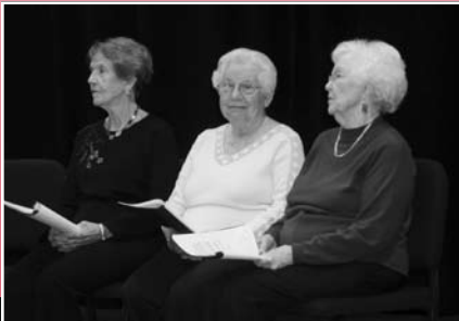
◀ Time Tapestry photos from the Tampa Bay Performing Arts Center education program for On Golden Pond in Tampa, Florida.

Ann Shrewsbury, Time Warner Cable, Lincoln, Nebraska