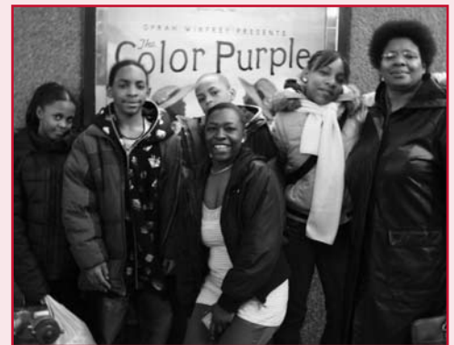
▲ Families from the Dunton Block & Civic Association in Queens, New York, participated in the Family First Nights program this spring.